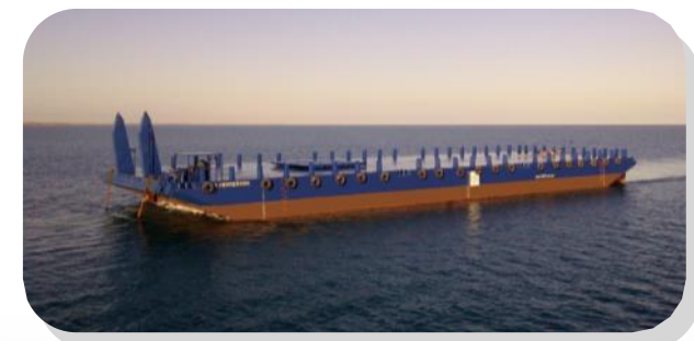
A.M.S. HENDERSON 250ft x 80ft x 16ft Deck Cargo Ballast Tank Barge