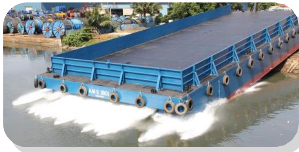
A.M.S. 1801 180ft x 60ft x 12ft Deck Cargo Barge