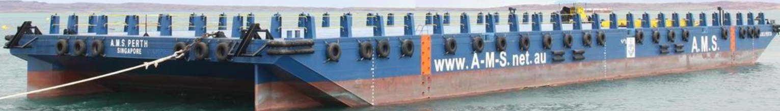
A.M.S. PERTH 250ft x 80ft x 16ft Deck Cargo Ballast Tank Barge