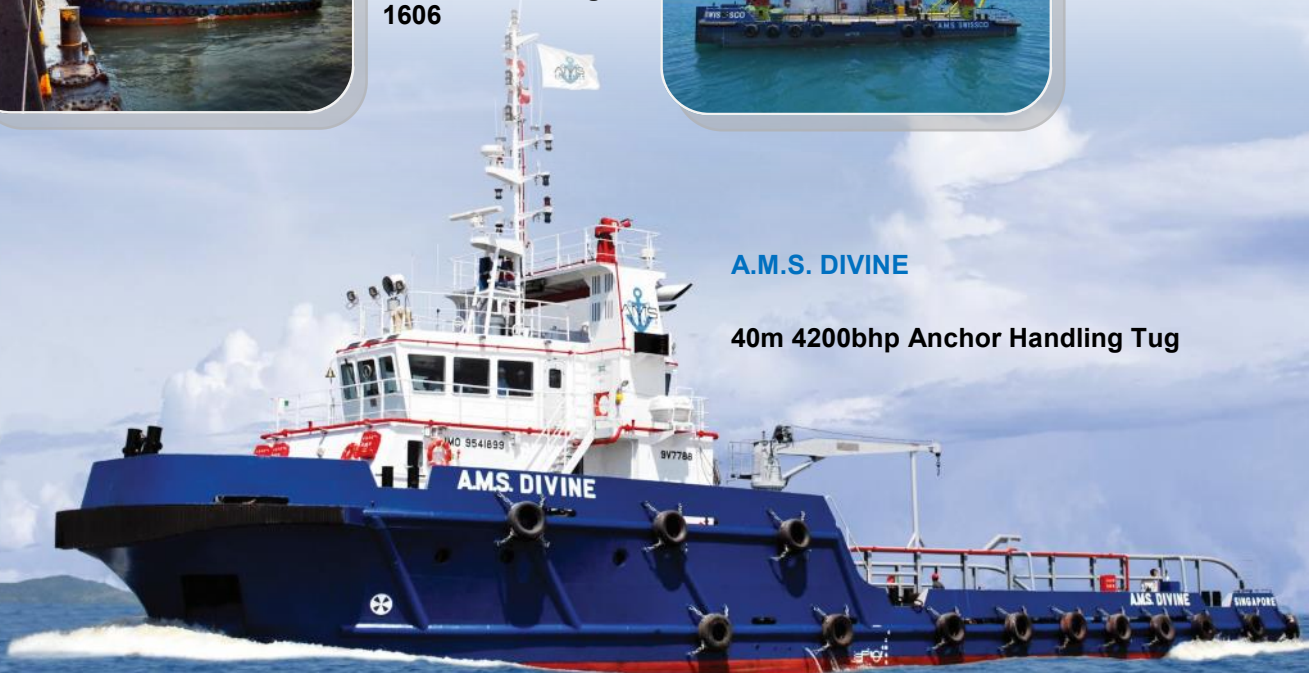
A.M.S. DIVINE 40m 4200bhp Anchor Handling Tug