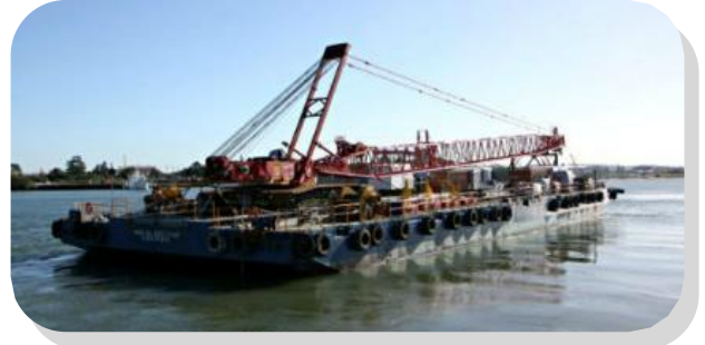
A.M.S. GLADSTONE 210ft x 70ft x 14ft Deck Cargo Ballast Tank Spud Barge