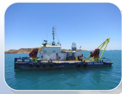
A.M.S. SWISSCO 28m 1440bhp Shallow Draft Workboat