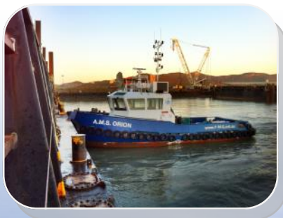
A.M.S. ORION 16m 1200bhp DAMEN Stan Tug 1606