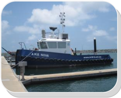
A.M.S. NOVA 16m 1200bhp DAMEN Stan Tug 1606