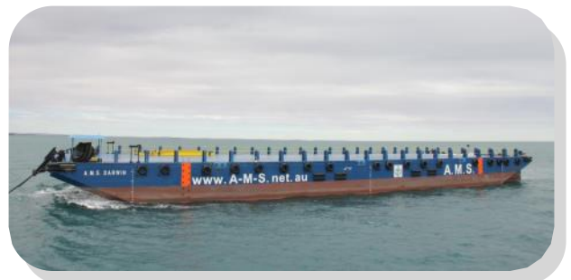
A.M.S. DARWIN 230ft x 80ft x 16ft Deck Cargo Ballast Tank Barge