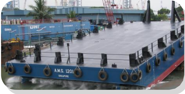
A.M.S. 1201 35m Construction Barge