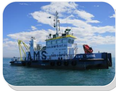
A.M.S. SHINE 28m 1500bhp Shallow Draft Workboat